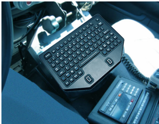
Photo of typical M779 installation in a police cruiser.

The design minimizes grooves where dust or other elements may accumulate, making it simple to wipe down for cleaning. This new design helps preserve a "clean room" environment.