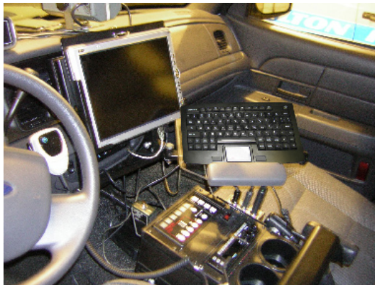
Photo of typical M901 installation in a police cruiser.

The M901 keyboard is constructed from high quality, impact-resistant polycarbonate plastics to provide excellent environmental protection, comfortable usage, and attractive styling.